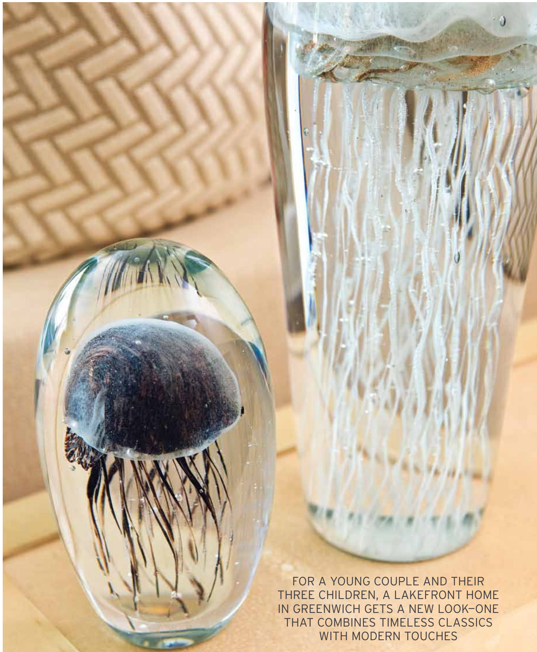
FOR A YOUNG COUPLE AND THEIR THREE CHILDREN, A LAKEFRONT HOME IN GREENWICH GETS A NEW LOOK—ONE THAT COMBINES TIMELESS CLASSICS WITH MODERN TOUCHES