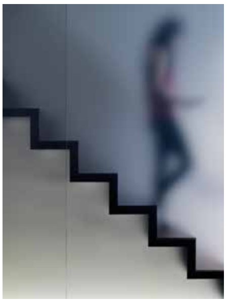
Clockwise from top: A view of the dining and living rooms featuring a floor-to-ceiling glass extension that opens into the garden; the tinted glass-enclosed staircase leads to the main floor; the sitting area includes a pair of taupe Vladimir Kagan lounge chairs, a Charles Hollis Jones square lucite table with polished nickel accents and custom wool and silk carpet.