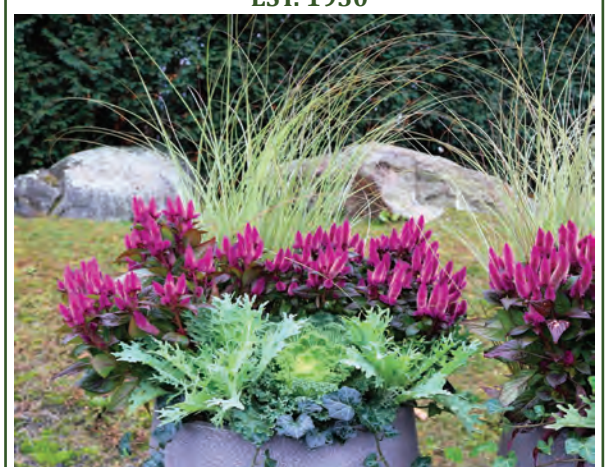
Full Service Garden Center