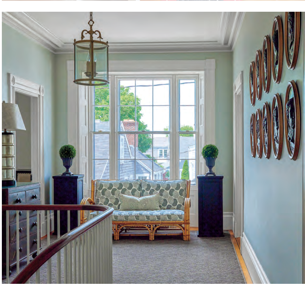
Modern Mash-Up (LEFT) In the living room, a Jonathan Adler vase tops the Maison Gerard 1960s coffee table from Greenwich Living Design, the skirted Decker sofa is through Motif Designs, and the custom ottoman sports a Kravet linen. A pair of Hackney floor lamps are from Circa Lighting. Divine Details (ABOVE, TOP TO BOTTOM) The repainted kitchen is bright and breezy. The cast-resin cameos in the second-floor hallway are from Martell & Suffin Antiques, the brass lantern is from Foundry Lighting. See Resources.

Nantucket for many generations, took down a wall between the family room and kitchen, and added a powder room in the process. He refinished all the wood floors, millwork and front staircase, painted the walls inside and out, renovated the bathrooms, and redid the lighting. He also removed